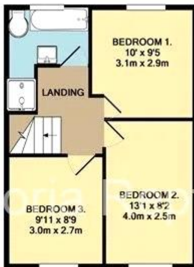
1ST FLOOR APPROX. FLOOR AREA 390 SQ.FT. (36.2 SQ.M.)

TOTAL APPROX. FLOOR AREA 780 SQ.FT. (72.5 SQ.M.) Made with Metropix ©2013