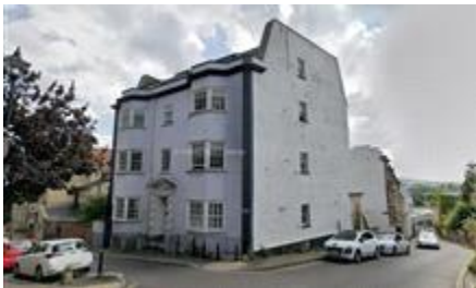
Flat, Granby Hill, Clifton BS8 £1,595 pcm